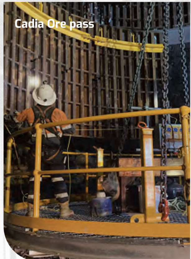
Cadia Ore pass

This system enabled the safe and efficient lowering of ore cans, a specialised innovation that enabled the Cadia Ore Pass project to be completed a full 2 months ahead of schedule compared to previously completed ore passes.