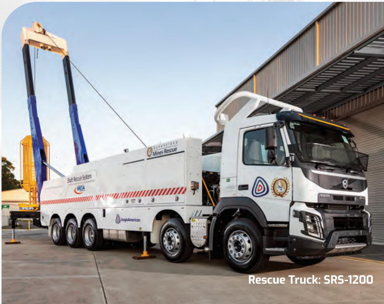
Rescue Truck: SRS-1200